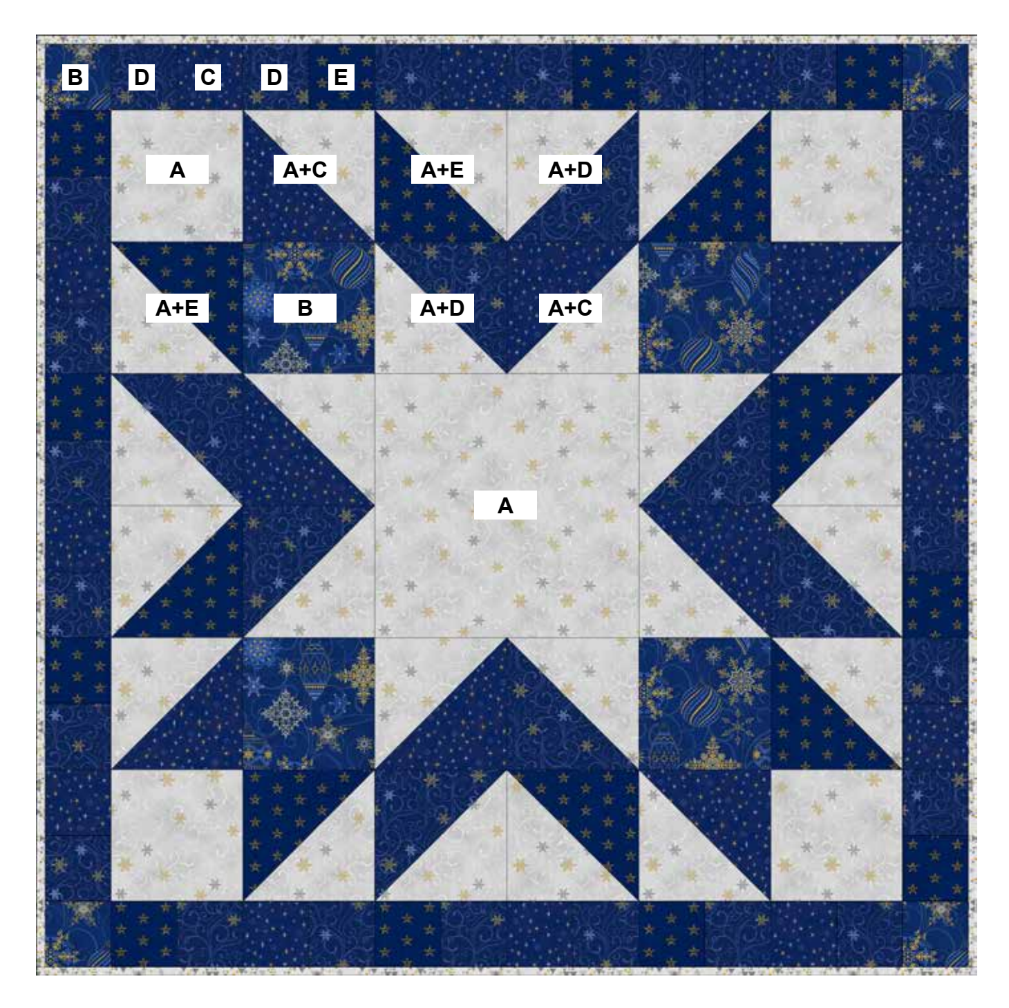
Binding is fabric F