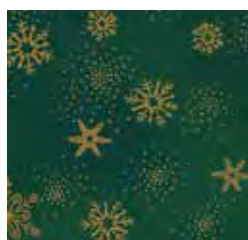
4 different green fabrics